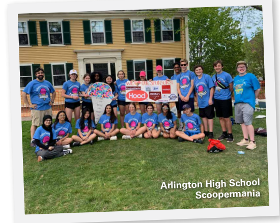
Arlington High School Scoopermania